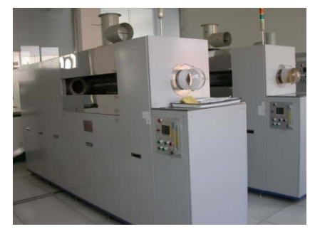
Glass-seal(CRS) Furnace Lower-Temp. (Imported)