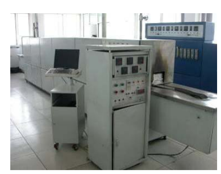
Vacuum Brazing Furnace Low-Temp. (Imported)