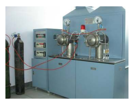
Pre-Oxydization, Annealing Equipment (Imported)