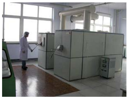
Ceramic-Eyelet Processing Special Equipment