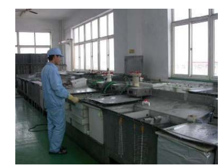
Advanced Plating Lines

The equipments listed out are only a portion of in-house equipments, these advanced top-brand equipments are capable of handling ceramic-to-metal seal, glass-to-metal seal process, high-temp brazing, low-temp brazing, plating process, etc.